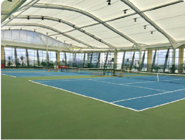
Image result for beautiful indoor tennis facilities | Bóng tennis, Bóng chuyền, Chó săn pinterest.com

Thank you city of Langford for upgrading Langford's only public tennis courts at Centennial Park! The only thing better than that would be to add more courts and cover two of them to extend the playing season. The cover does not have to be an enclosure - a roof would be enough! Beautiful, right?