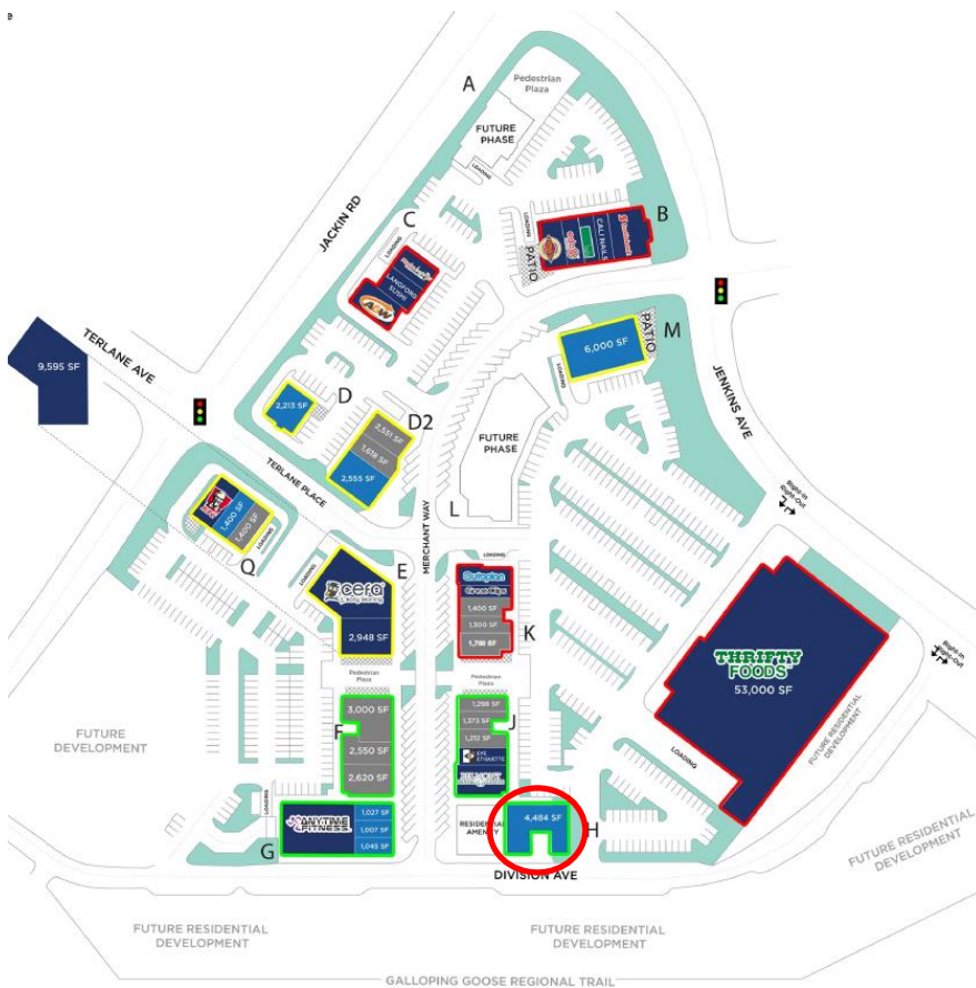
Figure 1: Proposed location of The Original Farm Langford Ltd. Cannabis Retail Store