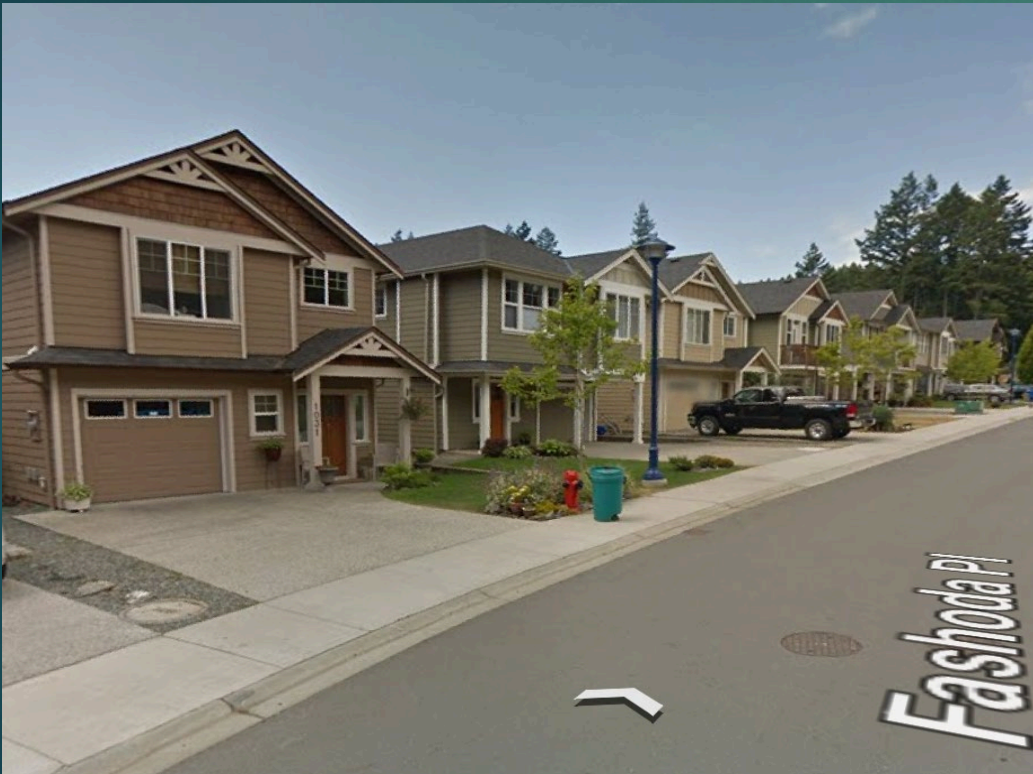
TRADITIONAL HOMES ON FASHODA