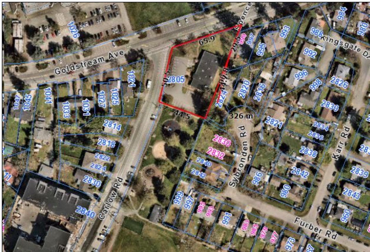
Figure 1: Subject development site

The subject property contains Centennial Park and is located on the corner of Goldstream Avenue and Carlow Road. Centennial Park is a destination park in Langford that includes several ball diamonds, a concession, playground, splash pad, tennis courts, off-street parking, and the Centennial Centre for Arts, Culture & Community, operated by West Shore Parks & Recreation. The area proposed for this rezoning is the portion of the property where the Centennial Centre for Arts, Culture & Community is located. The existing structure is a single storey building made up of nine trailers and is the site of the former Langford City Hall. The site of the proposed rezoning is shown below in Figure 1.