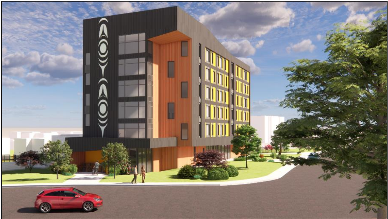
Figure 2: Proposed Building, facing Goldstream Avenue

M'akola has provided the City with a rendering of the proposed building, shown below in Figure 2. The materials featured include cementitious panels and siding, and vertical metal siding. Detailed designs will be reviewed through the Form and Character Development Permit process and will be approved in accordance with the City's Design Guidelines.