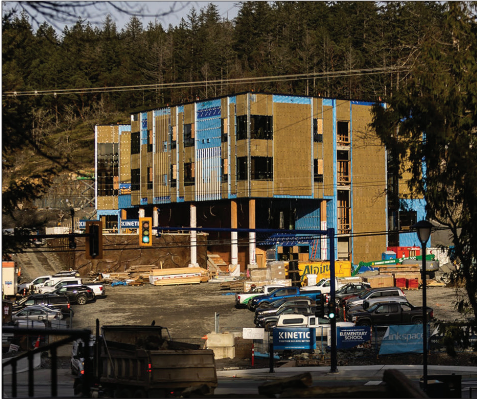
Construction continues on the new SCIANEW STELITKEL Elementary School in Langford.