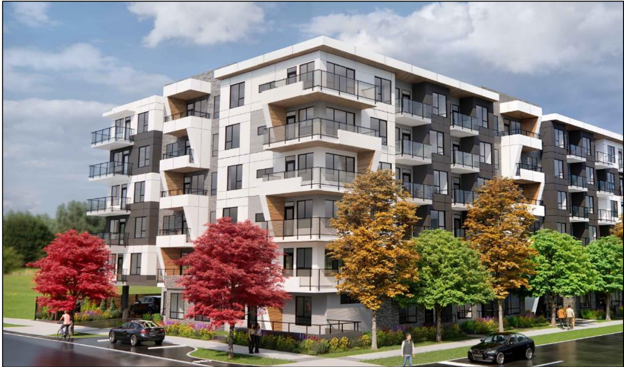
Figure 2: Conceptual Rendering

The applicant has provided a conceptual rendering of the proposed development to demonstrate the intended form and character, shown below in Figure 2. The building exhibits a modern design with proposed materials of Hardie panel, Hardie plank, stone veneer, and accents of wood siding.