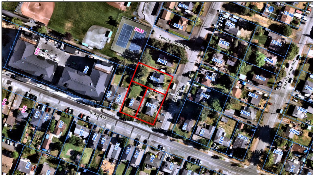
Figure 1: Subject Properties

School District No 62 has been made aware of this application such that they can consider the proposed increase in density in this area as part of their long-range facility planning. The subject properties are located approximately 750 m from Ruth King Elementary School and approximately 600 m from Spencer Middle School.