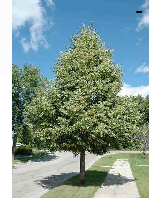
TILIA CORDATA 'GREENSPIRE'