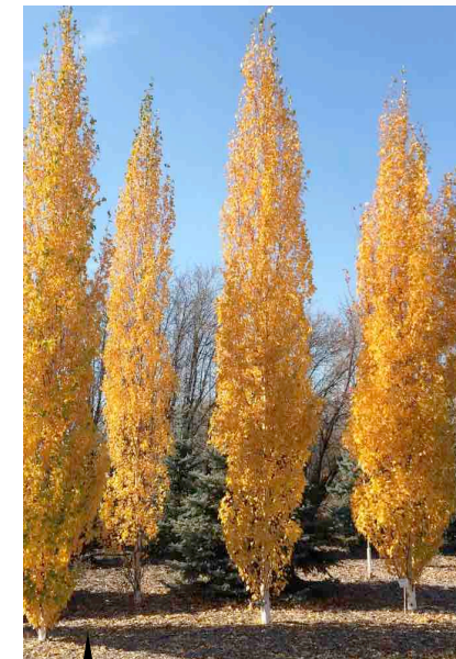
BETULA PLATYPHYLLA 'JEFPARK'