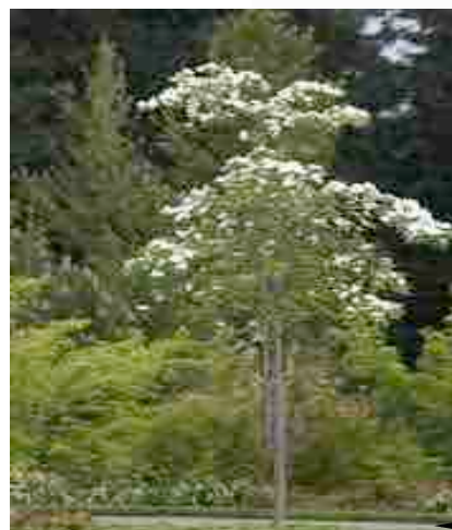
CORNUS 'EDDIE'S WHITE WONDER'