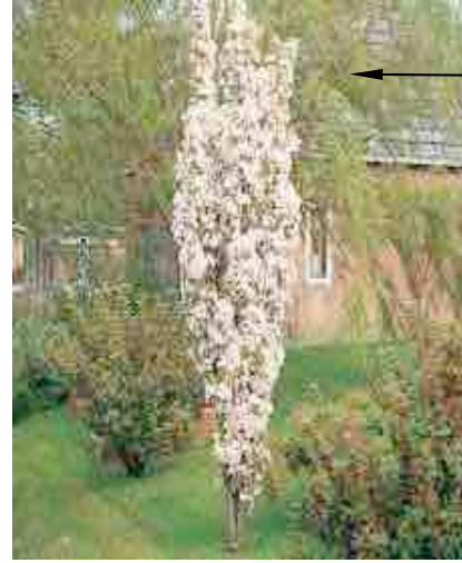
PRUNUS SERRULATA 'AMANOGAWA'