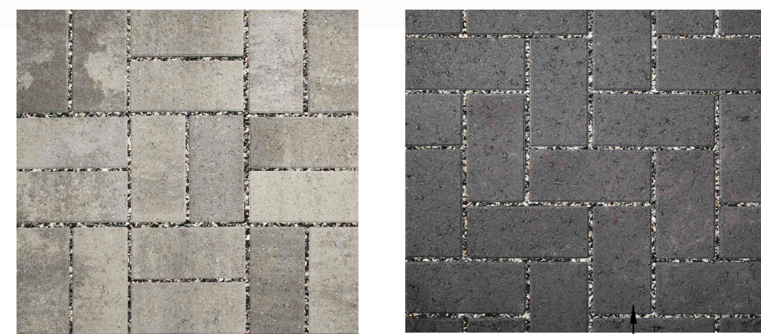
BELGARD PERMEABLE PAVERS, AQUALINE SERIES, IN MIDNIGHT AND NATURAL