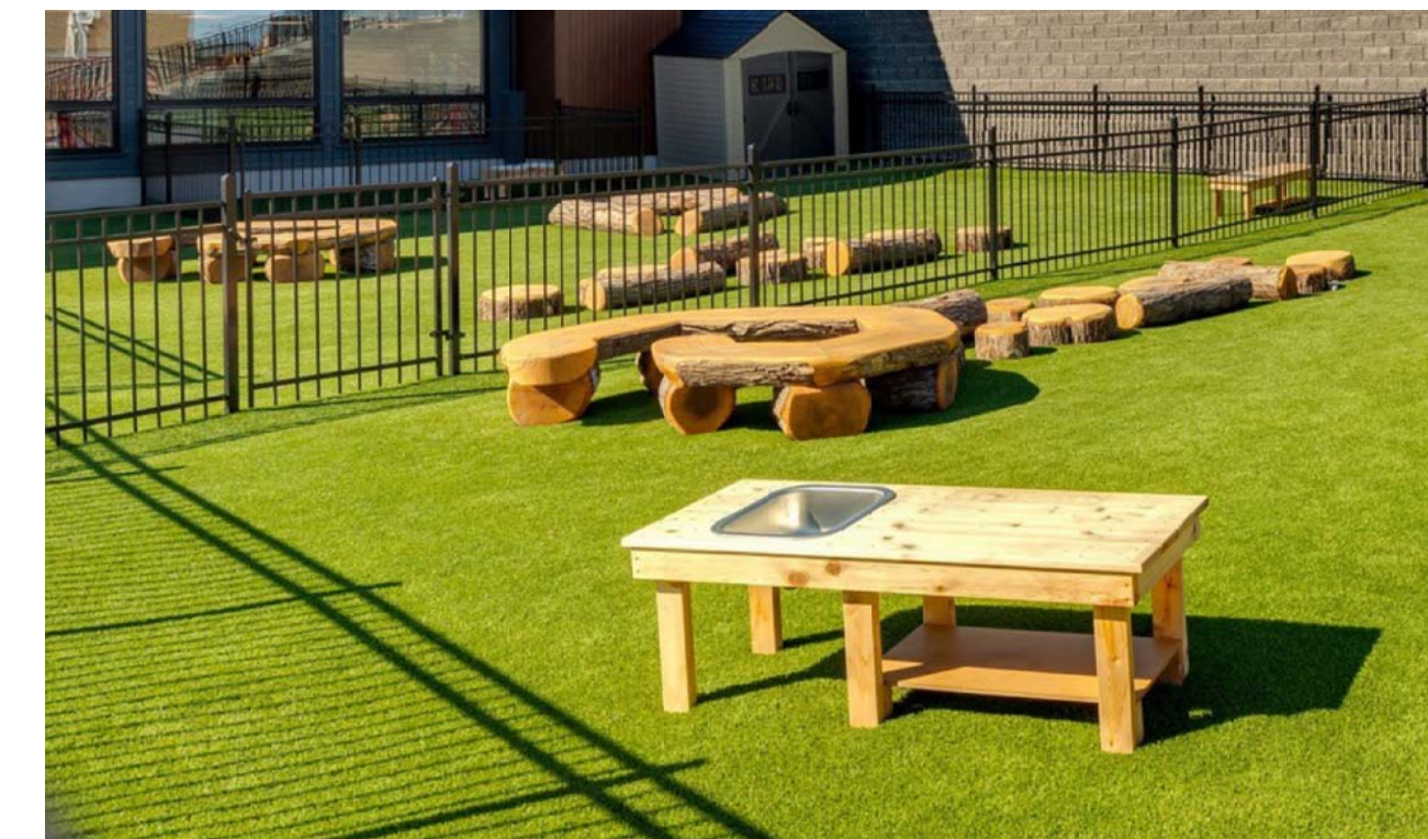
4" HIGH ALUM. FENCING & GATE BETWEEN PLAY AREA