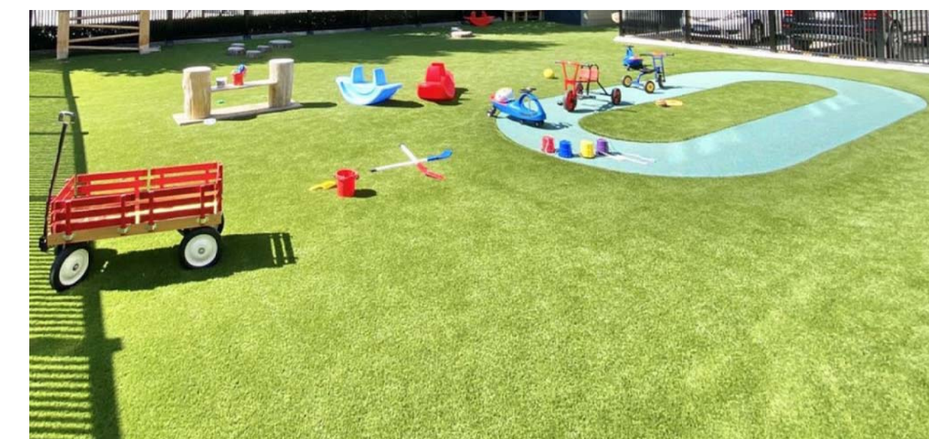
SYNTHETIC GRASS SAMPLE IMAGE