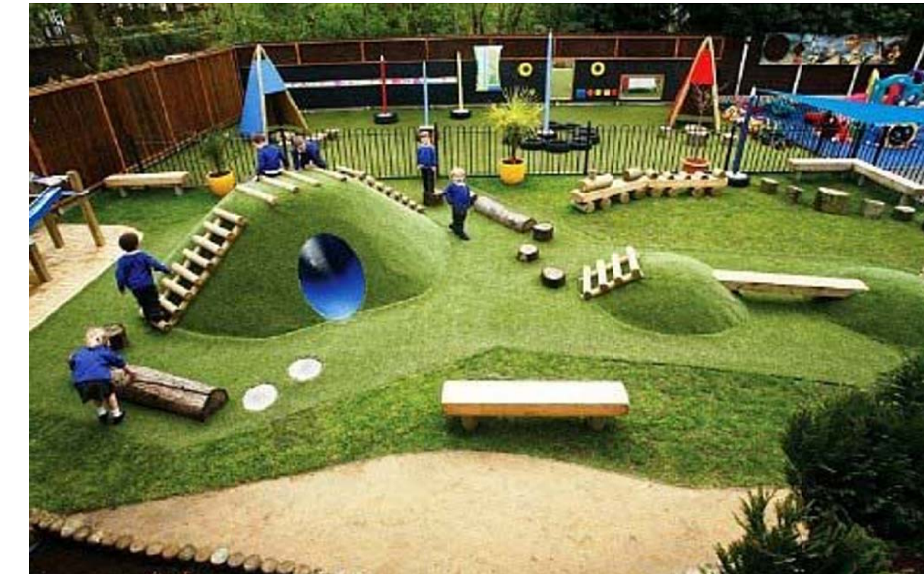
PADDED TURF SAMPLE IMAGE

02 PLAY GROUND SITE PLAN A02 3/16" = 1'-0"