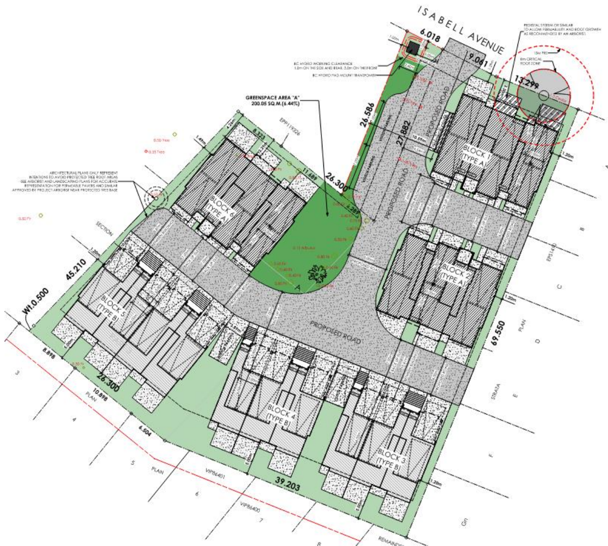
Figure 2: Proposed Site Plan

Five of the townhouse blocks contain three units, while the remaining block is composed of four dwelling units. Four of the blocks feature single-wide double car garages and two storeys of living space above, which are large enough to accommodate 3-bedroom layouts plus a den space on the main floor. The three