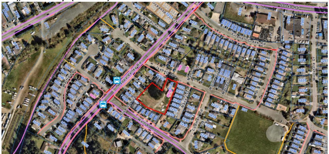
Figure 4: Ortho Map Showing Bike Lanes (purple lines), Sidewalks (pink lines), Trails (orange lines), and Bus Stops (blue icons):

There are several bus stops within walking distance of the development site, including two bus stops along Happy Valley Road near the intersection of Happy Valley and Walfred Road, which provide access to routes 48, 52, 55, and 64. Route 48 offers service to and from downtown Victoria during peak commuting hours. Route 52 runs throughout the day to provide service between the Colwood Exchange and Bear Mountain. Route 55 offers service to Langford Exchange, which in turn offers transfers to many other routes, including Blink Rapid Line 95, a key commuting service into downtown Victoria. Route 64 travels from Langford Exchange to Sooke Town Centre via Happy Valley Road. Multiple other bus routes are available along Sooke Road within walking distance of the site.