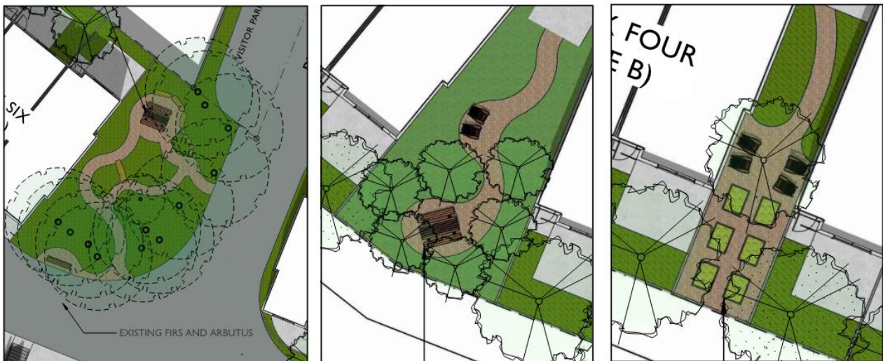
Figure 3: Common Amenity Areas

Each unit contains no less than 10m 2 of ground level private open space for the use of the residents of each townhome. Additionally, a total of three separate strata amenity spaces are proposed to be located throughout the site, as shown in Figure 3 below, and on the attached landscape plan. The first and the largest amenity space, where the majority of tree retention on site is to occur, features a seating area, and a natural playground. The second common amenity space features a picnic table and seating within the community orchard, while the third proposed common open space features some seating as well as six garden boxes for the use of future residents.