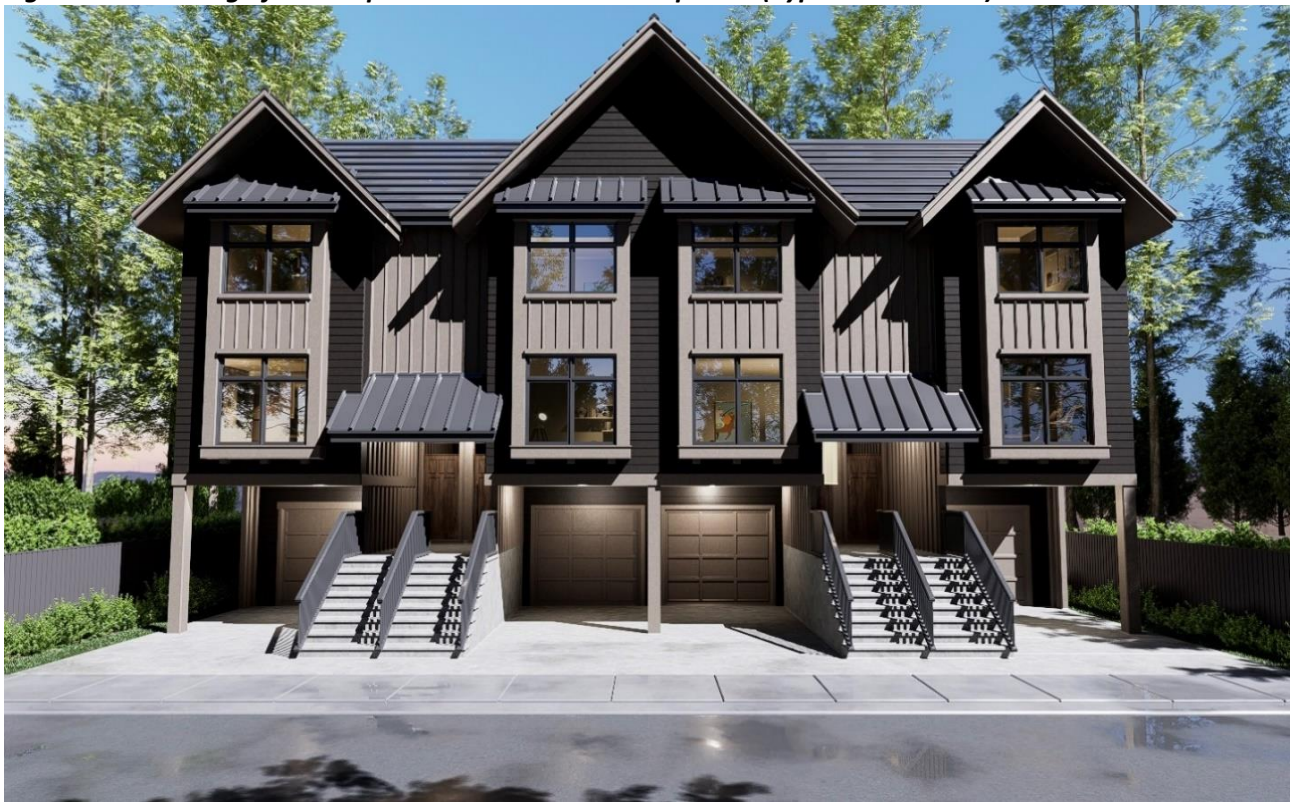
Figure 4: Rendering of the Proposed Townhouse Development (Typical Blocks 3-5)

The buildings have a West- Coast traditional style. The primary materials proposed are concrete fibre lap siding and board and batten, in earthy natural tones, with black metal accent roofs. The final design, including finishing materials, will be secured through the Form and Character Development Permit.