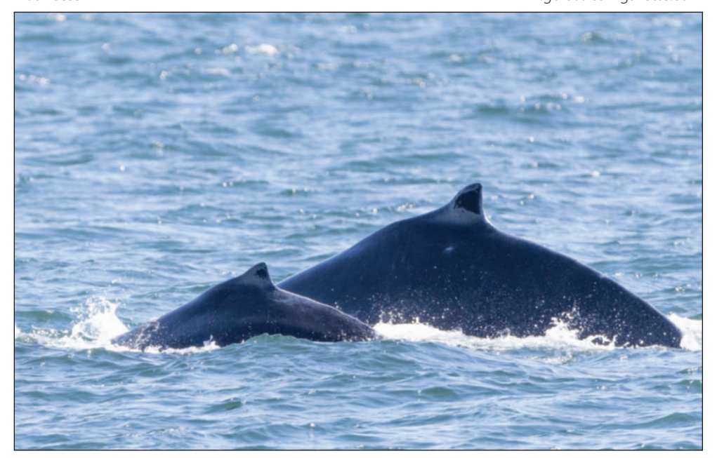
Black Pearl and her 2024 calf.