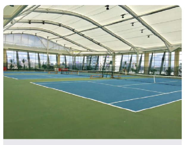
Image result for beautiful indoor tennis facilities | Bóng tennis, Bóng chuyền, Chó săn pinterest.com

Thank you so much for considering this addition to your plans!